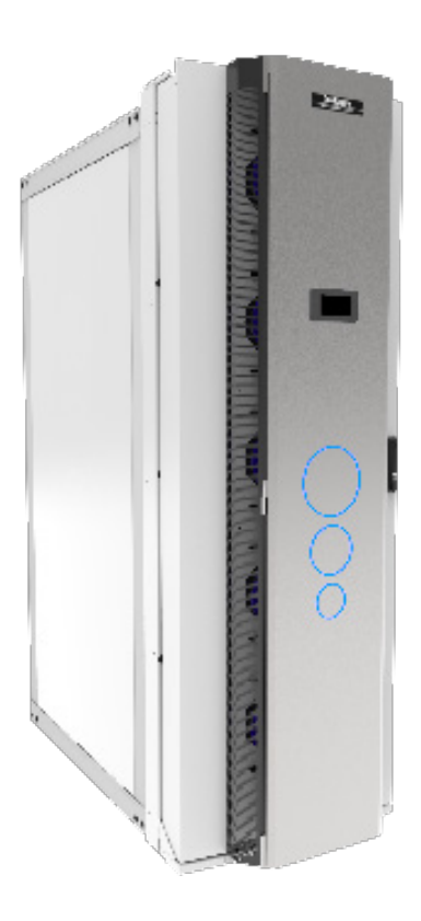
Over 200kW In A Single Rack